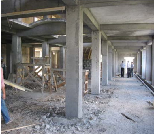
Sf Gheorghe incubator...before

Initiated by UNDP Romania in early 2005 with a pilot-phase, the Establishment and Development of Business Incubators project rapidly worked to set up three business incubators in the counties of Brasov, Alba and Covasna. The project that supports regions affected by substantial layoffs from the state sector, presently facing high unemployment rate and poor entrepreneurial activity.