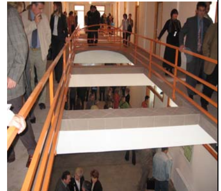
Sf Gheorghe incubator...after

The premises were completely refurbished with financial support from UNDP and the Brasov County Council and turned into a high-standard incubator, ready to host 20 SMEs and "nurture" their business, until