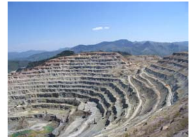
Rosia Poeni Copper Mine

Apart from presenting the progress since the last EnvSec meeting in Skopje, Macedonia, the Conference in Romania introduced a number of reports prepared by UNEP, including: “Desk Assessment on Reducing Environment and Security Risks from Mining in South Eastern Europe” and “Rapid Environmental Assessment on the Tisza River Basin”. Pollution from mines and related industries has been pinpointed by countries in South Eastern Europe and the Tisza River Basin as one of the biggest environment and security threats. A report from EnvSec group “Mining for Closure” argues that pollution of water, emanating from toxic mines wastes or ‘tailings’, is among the overriding issues countries need to address. The report also identifies why mining in the region has become such a big issue.