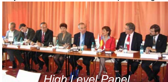
High Level Panel

For more information please contact environment@undp.ro