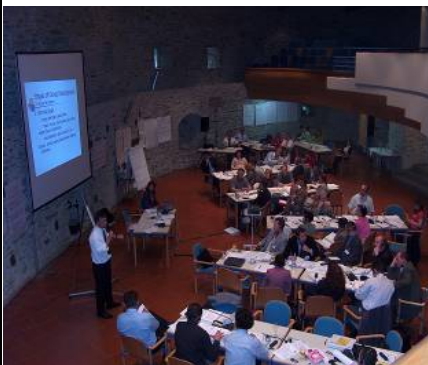
Regional Seminar on Human anti-trafficking in Austria

Trafficking in human beings is a key criminal phenomenon, often supported by endemic corruption, fraud and well-established money laundering practices. The current growth of transnational criminal organizations, and free flow of people, money and goods creates conditions that facilitate the illicit movement of drugs, weapons, people and money. Human trafficking affects the lives of hundreds and thousands of people all over the world. By generating new and more refined forms of slavery, the criminal networks violate basic human rights and contribute to a demographic and economic destabilization of the countries affected by such criminal activities, irrespective of their status as destination, transit or origin countries.