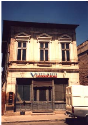
Trian Demetrescu Memorial House, Craiova

In cooperation with local authorities, companies and NGOs, the project will provide vocational training and counselling for selected disadvantaged youth to facilitate their further integration in local communities and, implicitly, contribute to the economic growth of the area.